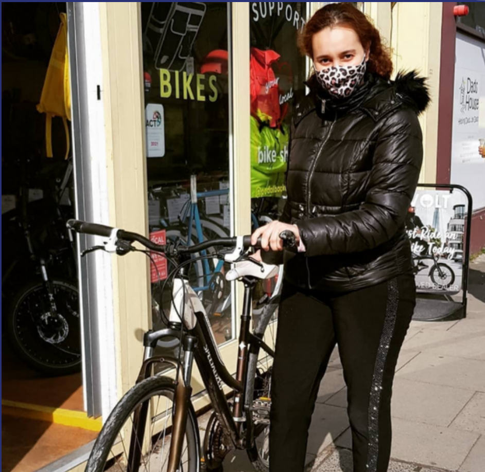
A local resident receiving a refurbished bike as part of the Pedal Gives Back scheme.

"We have turned a dream into reality – upcycling abandoned bikes and donating them to those most in need."