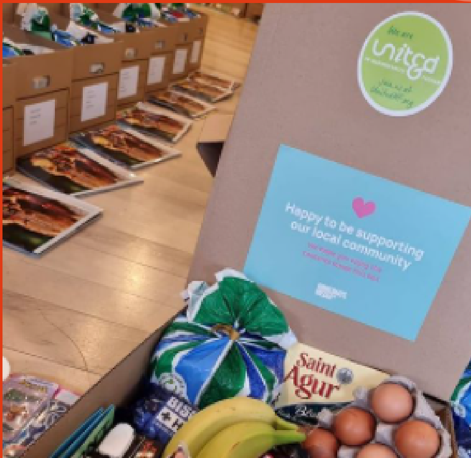
Immediate Media packed more than 300 food boxes for local children at risk of holiday hunger.

"We want to help the community we work in and look forward to working with everyone again."