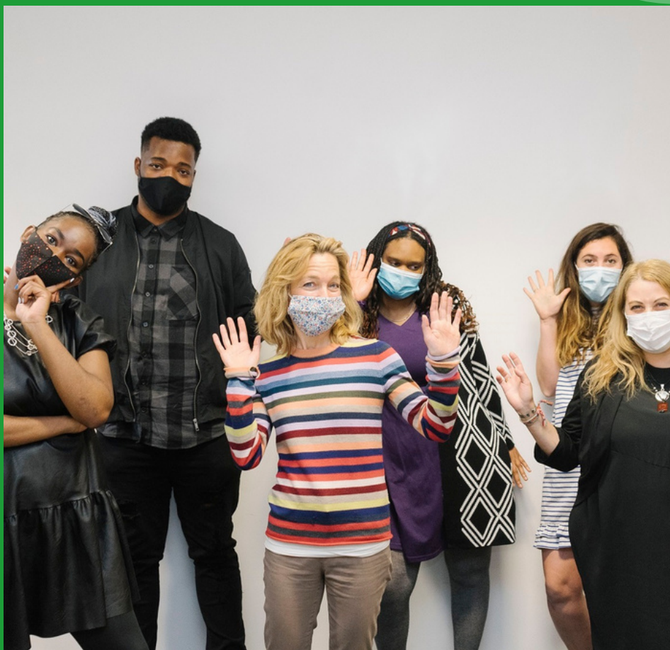
Our six Community Grants Panellists who will be assisting with allocating funds to local initiatives.

"It fills me with immense pride to know that I will be able to give back even more to the borough that has given so much to me."