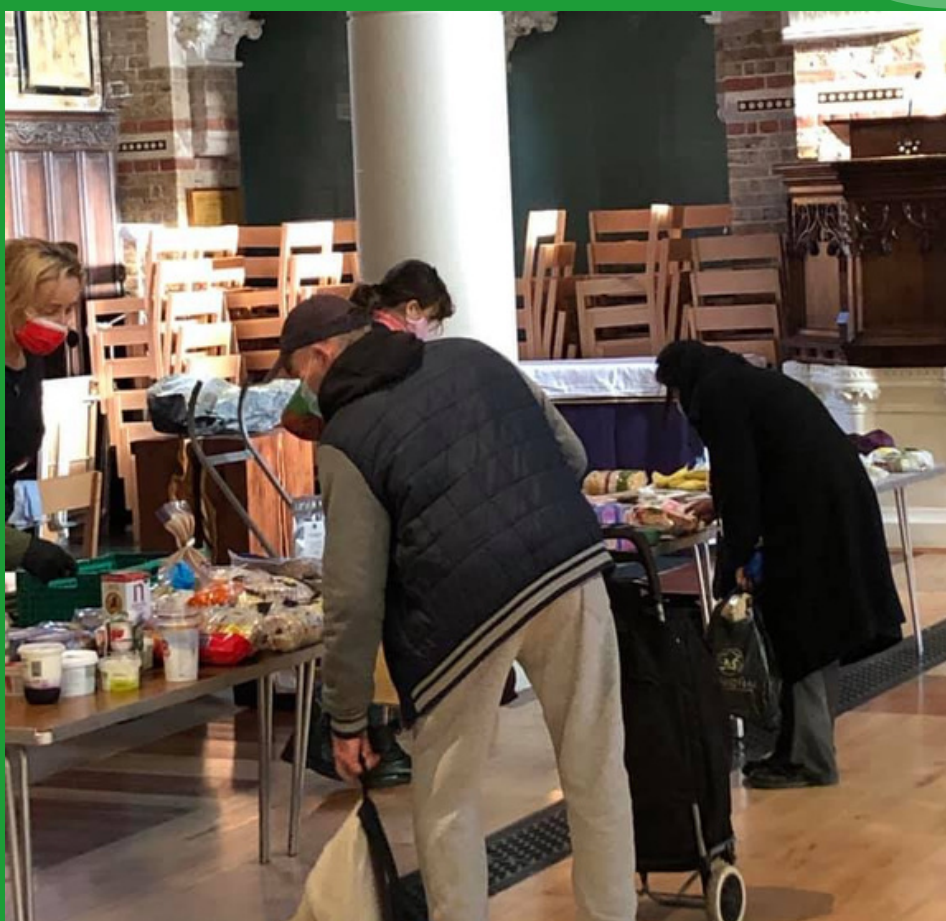
St Andrew's offers a drop-in service for the homeless, providing hot meals, free toiletries and second-hand clothing.

"The funding has enabled us not only to continue, but to provide a generous and welcoming service which has been a life-line to our guests."