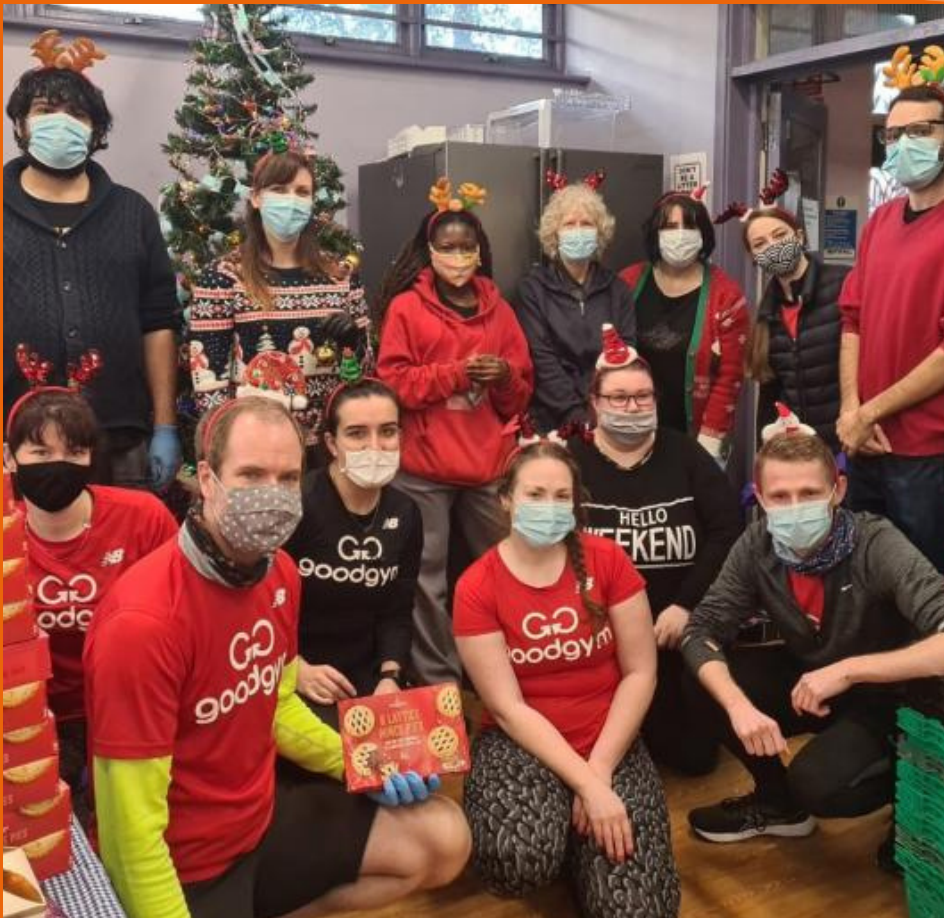
Volunteers who helped to prepare and deliver Christmas meals for over 500 older residents.

"This great initiative ensures that many local residents who might otherwise be on their own or not having a proper meal, will be enjoying a fantastic Christmas lunch."