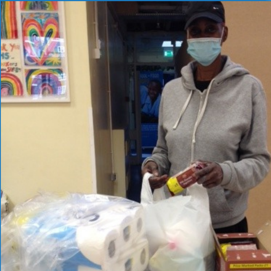
A volunteer at the White City Interfaith Partnership, providing essential food packages to those in need.

"If we work together, we can bring things into the neighbourhood that will lift everybody."