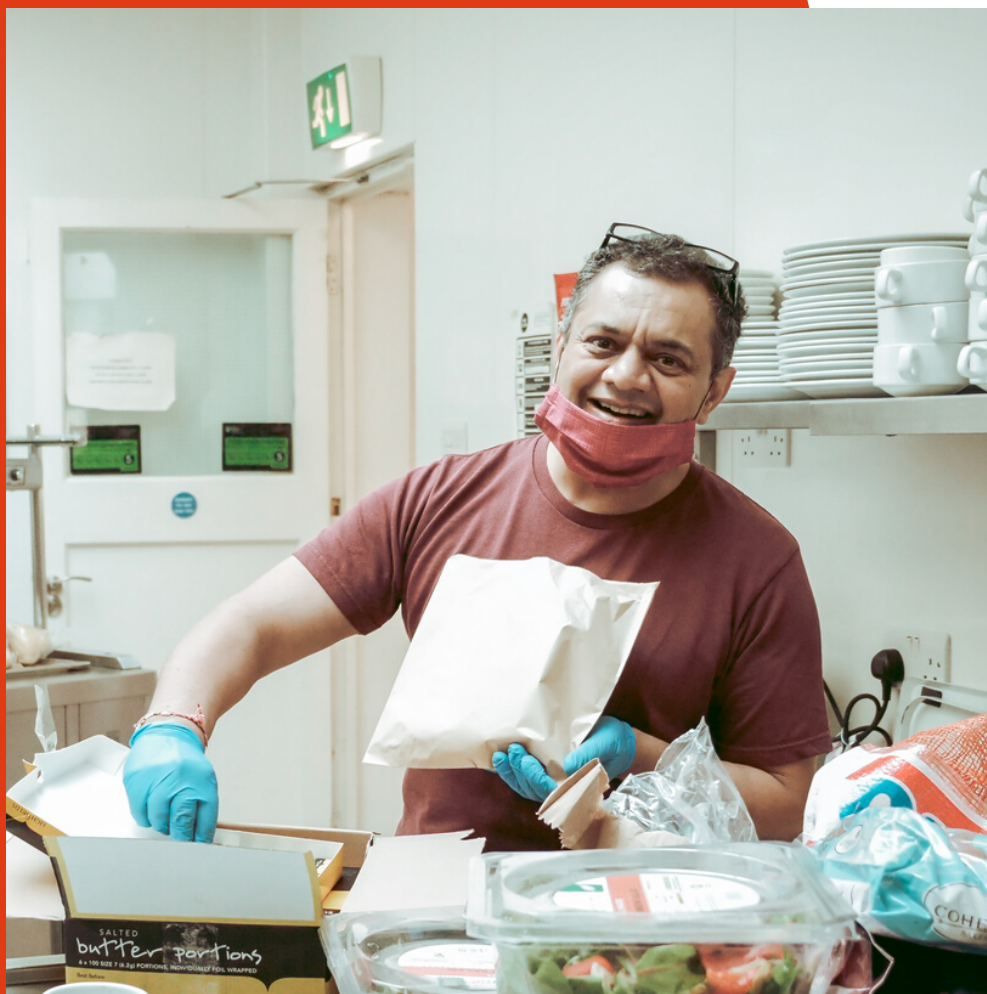
River House Trust serving the local HIV community during lockdown.

"We're truly grateful to see locals give money and time to help each other in these unprecedented times."