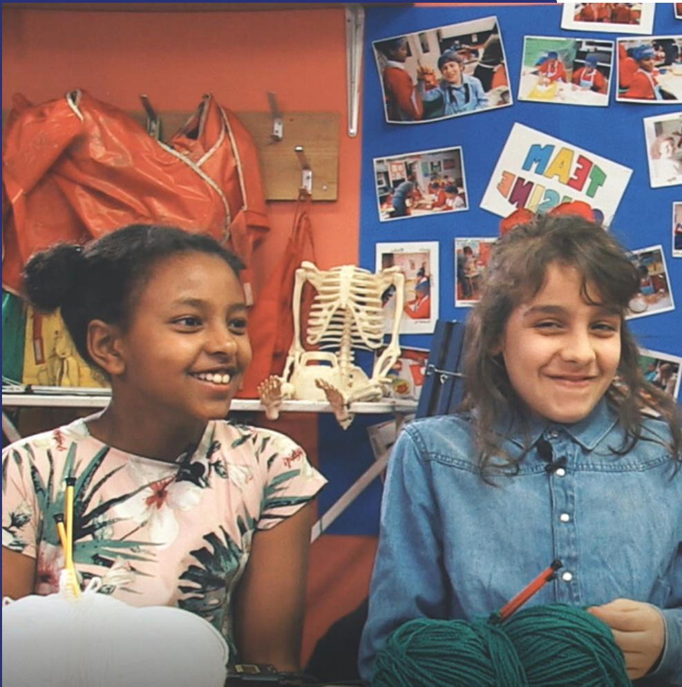
A still from 'Differences United' by Roter Su

“We are even more determined to position ourselves as a long-term, critical entity for positive change in Hammersmith & Fulham.”