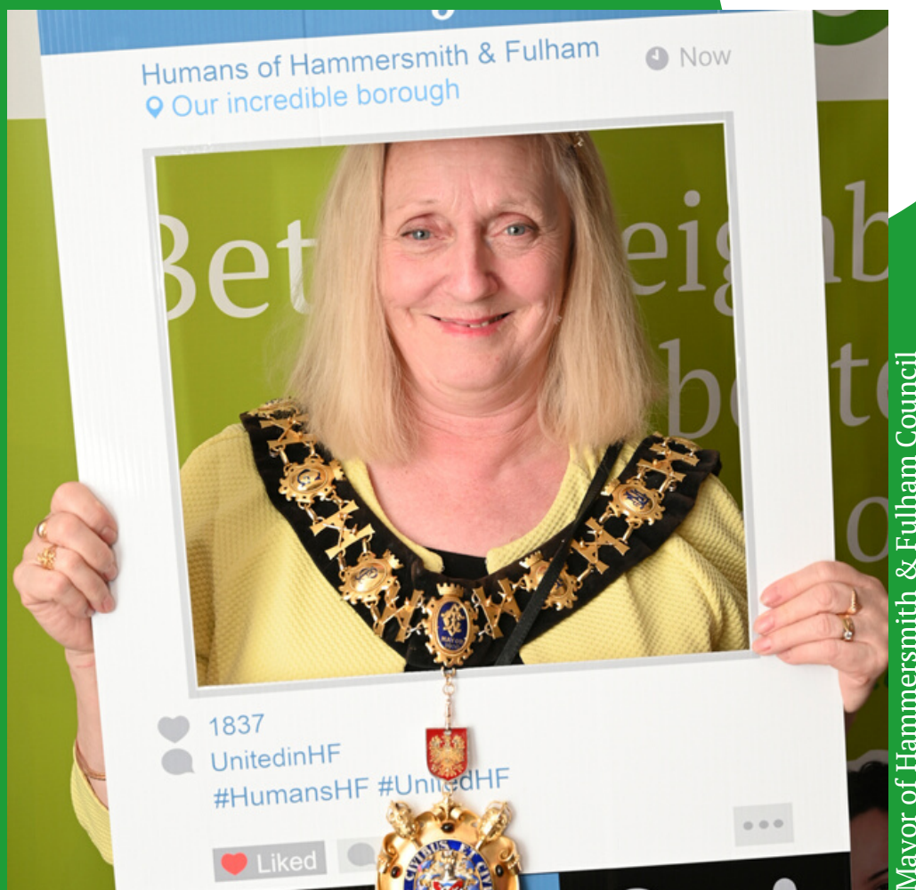
Mayor of Hammersmith & Fulham Council

"We've shone a light on how wonderful our borough is and the value of so many communities within it. People who are strangers, but neighbours, really have so much in common."